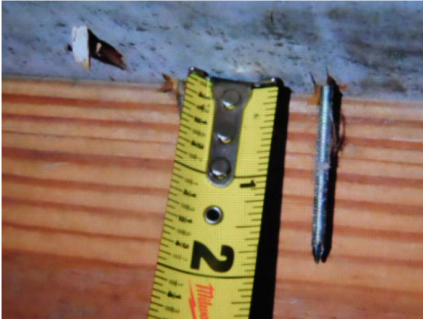
8d Nails or Greater in Size