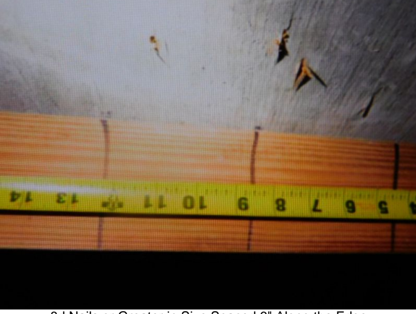
8d Nails or Greater in Size Spaced 6" Along the Edge