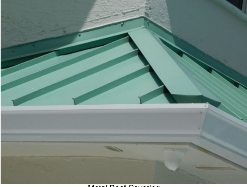
Metal Roof Covering