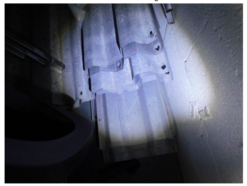
Non-Impact Rated Panel Shutters