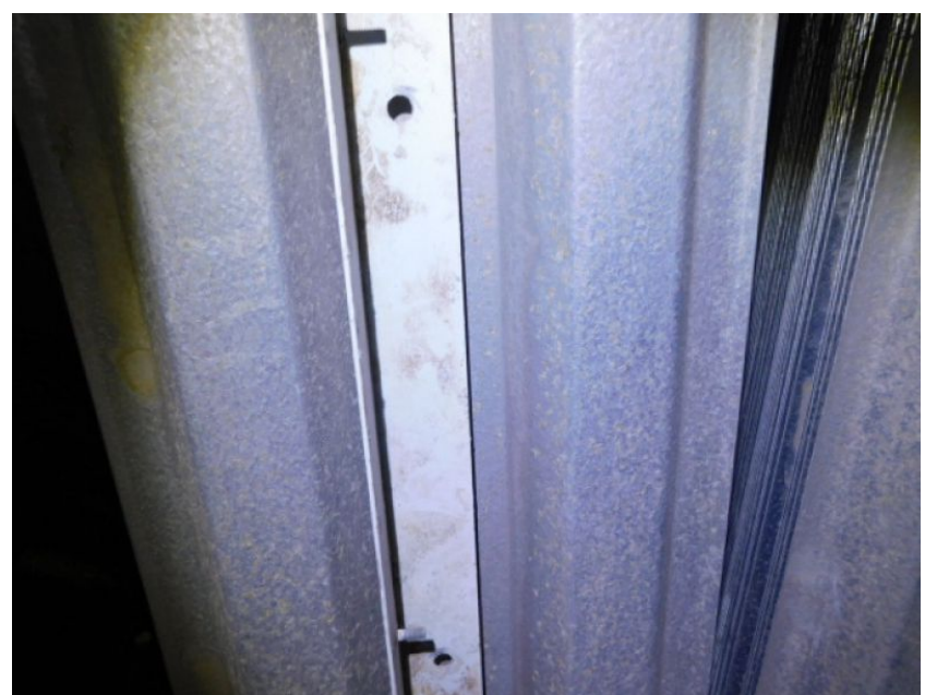
Non-Impact Rated Panel Shutters