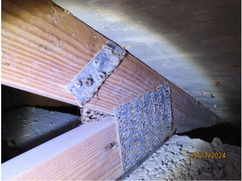
Single Wrap(Prior DMI photo)