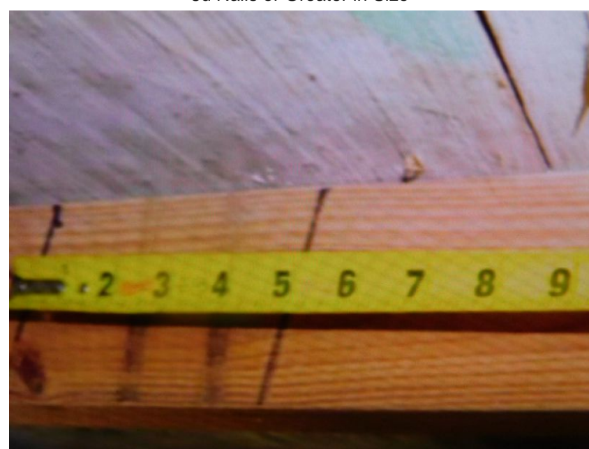
8d Nails or Greater in Size Spaced 6" in the Field