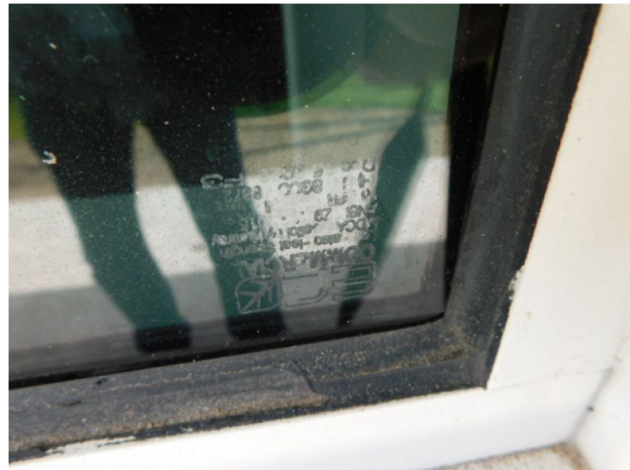
impact window etching