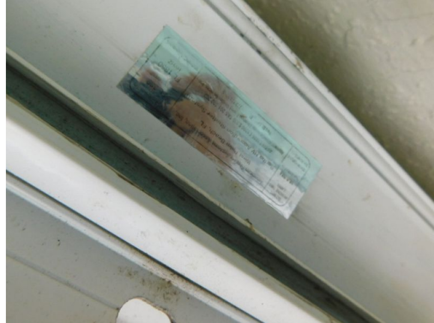
accordion shutter label