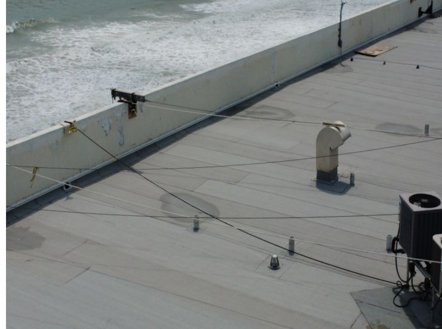
Built Up/Rolled Asphalt (Flat) Roof Covering