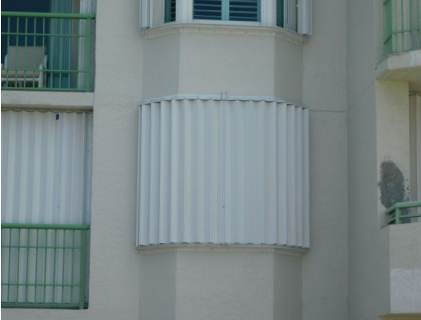
impact rated accordion shutters