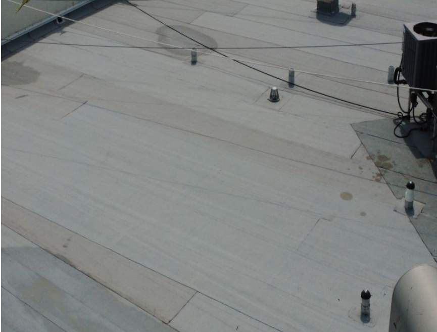
Built Up/Rolled Asphalt (Flat) Roof Covering