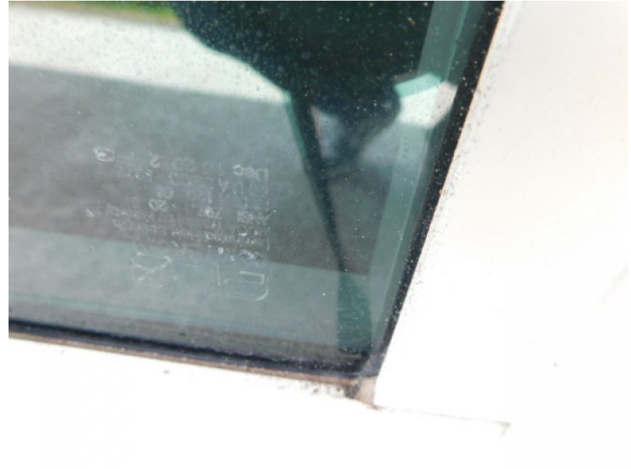
impact glazed door etching