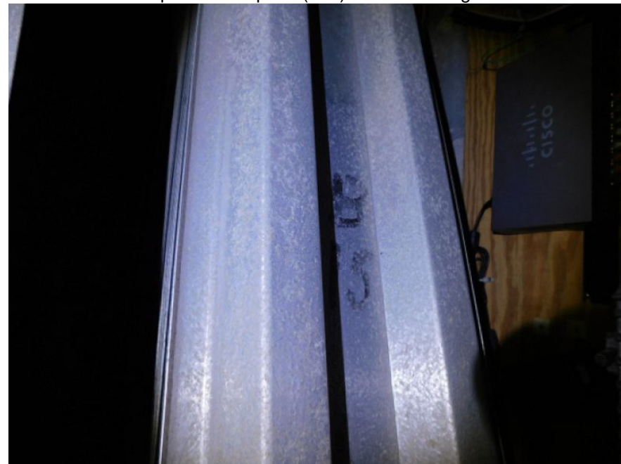
not rated panels