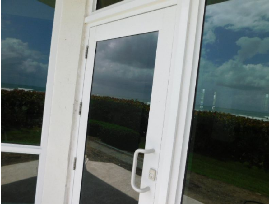
impact glazed door